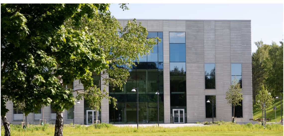
The new surgery building was completed in year 2020. The building is constructed in accordance with Miljöbyggnad 2.2 and the project has received an overall rating level Gold.

THE O-BUILDING has been awarded two prestigious awards during 2020 and 2021. The first award is the 2020 Acoustic Environment Award that was established by the Swedish Acoustic Society in 2018 to highlight efforts for a good sound environment in society. The motivation behind this award is that, with great personal commitment, continuity and good cooperation between all the construction parties involved, a functional hospital building has been created where every detail has been studied to create a good and safe sound environment for the benefit of both patients and employees. The second award is the 2021 Healthcare Construction Award in the category of larger healthcare construction projects. This award was established in 2003 by Forum vårdbyggnad with the aim of highlighting good examples of well-executed and innovative healthcare environments as well as good processes.